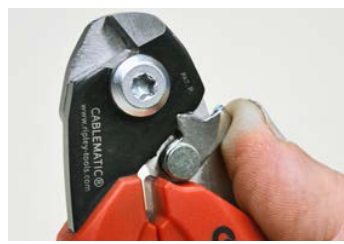
Convenient thumb lock easily closes the tool for safety & protection.

For more information or to locate your nearest authorized Ripley® distributor, visit www.ripley-tools.com or call 1 (800) 528-8665 to speak with a customer service representative.