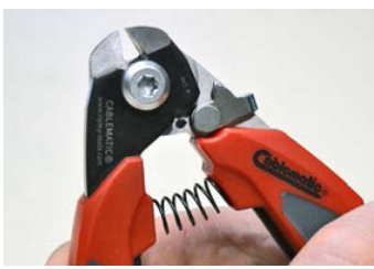
Ergonomic tool body is designed for comfort & easy operation.