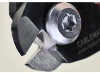
High quality blade provides precise cuts without wire distortion.