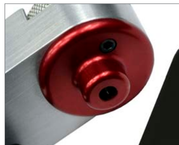
Recessed steel blade makes tool safe to carry & store.