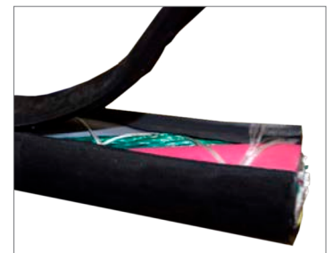
Quickly & easily performs ring, spiral & longitudinal cuts.