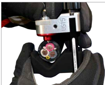
Quick-adjust jaw accepts hard & soft insulated cables ranging from 0.39" to 2.36" (10 mm to 60 mm).