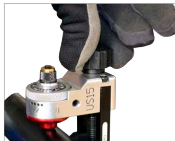
Knobs are engineered with knurls & grooves for easy adjustment when wearing gloves