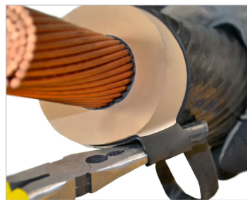
Score semi-con in a spiral pattern for a continuous chip.