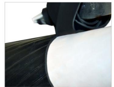
Square off the continuous chip with a clean, burr-free radial cut.