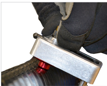
Blade depth is easily adjustable & set by turning the dial.