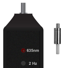
Unit comes with a 2.5mm universal input adapter. A 1.25mm converter adapter is available. See ordering information on the next page.