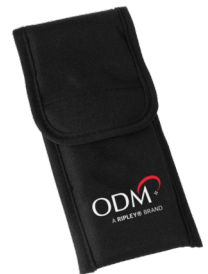
Single-instrument padded carrying pouch included.