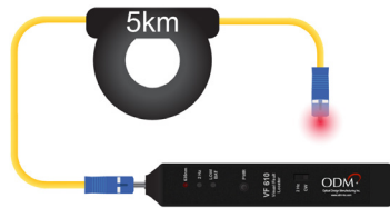
Laser is visible at fiber endfaces or patch panels up to 5km away from VF 610 output port.